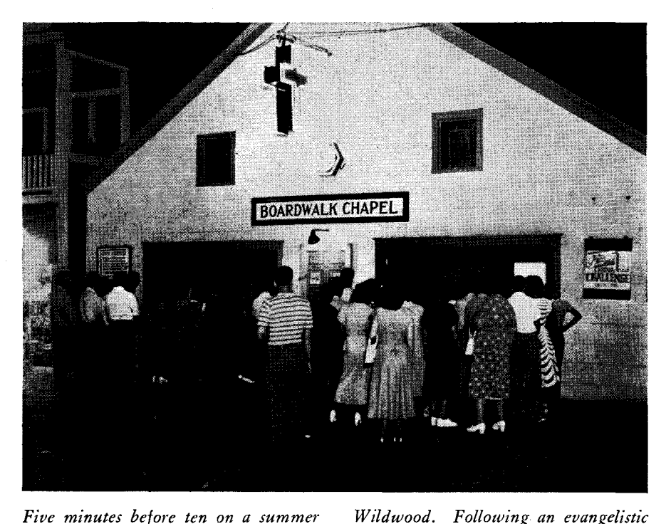
Five minutes before ten on a summer evening at the Boardwalk Chapel in

and sun bathers, but the souls of men. From the beach we follow the people to the crowded boardwalk where on a summer evening fifty thousand mill around seeking new pleasures and thrills. It is truly a modern Vanity Fair.