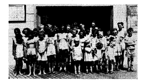
Children who attended the Bible hour at the Chapel.

The Chapel is owned by the New Jersey Presbytery of the Orthodox Presbyterian Church which has elected the Boardwalk Gospel Committee to conduct a vigorous evangelistic program reaching thousands of vacationers who come down to the sea in summertime. This committee invites Christians everywhere to consider for their vacation a place affording not only physical relaxation but also spiritual inspiration and refreshment to the soul. May it please God to cause many who go down to the sea to find in Christ salvation for their immortal souls here at the Chapel.