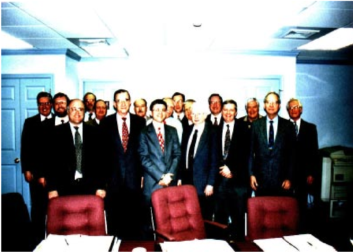
The Committee on Home Missions and Church Extension

Published by The Committee on Christian Education of