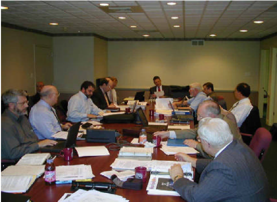
The Committee on Christian Education at Work in March, 2000