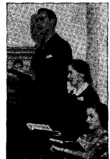
Wheaton Students in Fireside "Sing"

Life's crowning joy is helping others. Here is a way to make your own future secure while helping worthy young folks get a Christian education. Wheaton stands for the historic Christian faith and its students are active in spreading the Gospel. Hundreds of its graduates are missionaries. While helping prepare young people for Christian leadership, your Wheaton Annuity gives you steady, generous income, reduces taxes, avoids loss, saves expense and litigation.