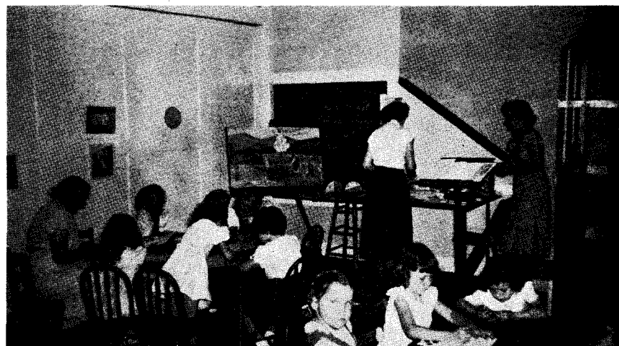
Another class at the West Collingswood school.