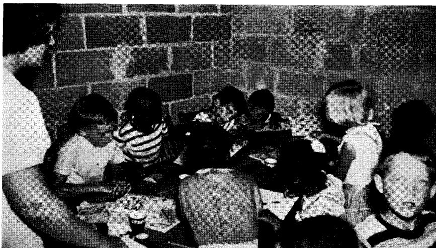
A corner of a basement room provides space for this interracial DVBS class at Calvary Church, Glenside, Pa.