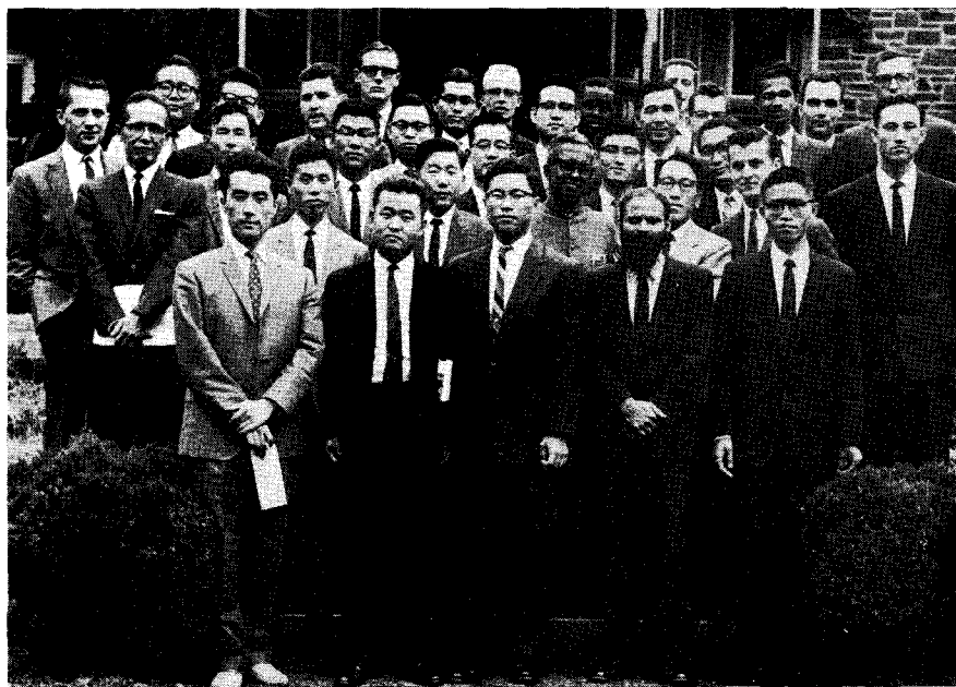
Forty-seven of Westminster Theological Seminary's 140-plus students are from countries other than the United States. About two-thirds of this group are pictured here. Canadian students number 17, while Korea leads those from the Orient with 10. Seven come from Japan, three from India, two each from Australia, Free China (Taiwan), and the Philippines. There is one student from each of four countries: Hungary, Kenya, Mexico, and the United Kingdom.