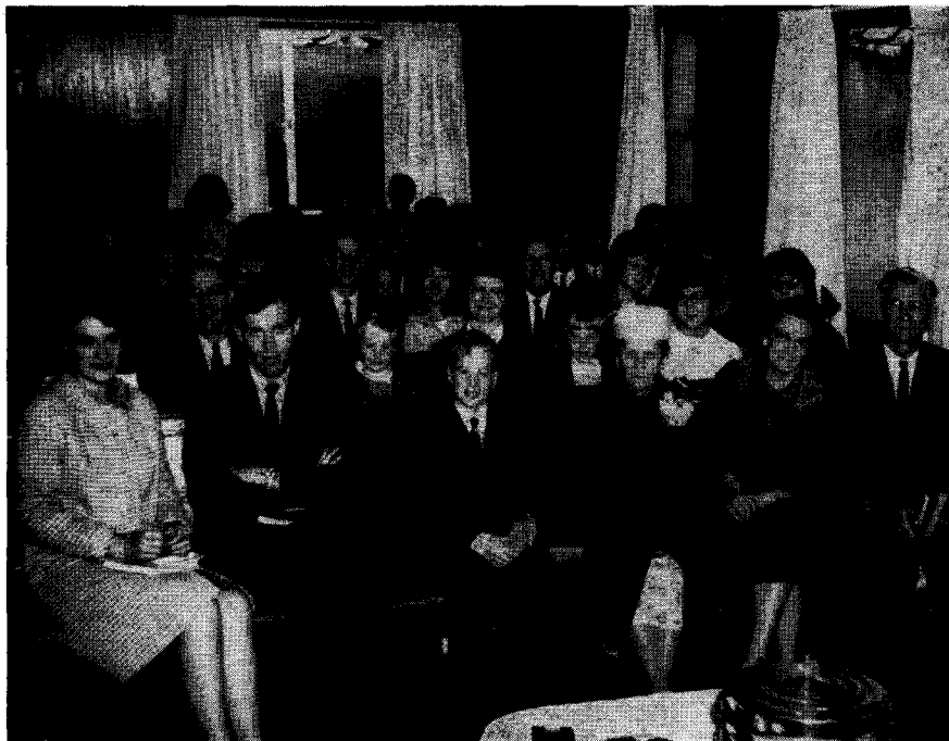
SEATTLE CONGREGATION IN ITS NEW MEETING-PLACE 28th Avenue S.W. and S.W. Holden Street

As pastor and people became increasingly concerned about their independence from any church fellowship or control, they looked about for a church body "which represented our