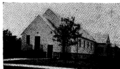
CALVARY PRESBYTERIAN CHURCH OF VOLGA, SOUTH DAKOTA