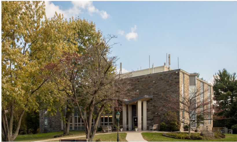
Westminster Theological Seminary

Participating in the OPC Timothy Conference will be those who are already ministers, as Paul was, together with young men who must be urged to take up fully the “gospel trust” given to the church and its ministers. Young, unordained “Timothys” are to be found in the covenant homes of OPC church