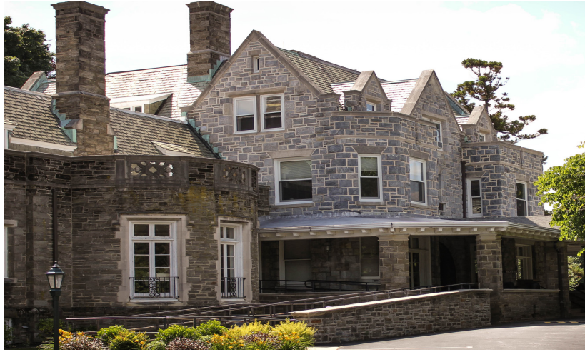
Westminster Theological Seminary

Participating in the OPC Timothy Conference will be those who are already ministers, as Paul was, together with young men who must be urged to take up fully the “gospel trust” given to the church and