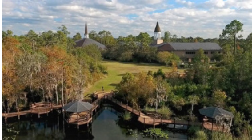
Reformed Theological Seminary - Orlando

The OPC Timothy Conference is for promising young men who are nominated by their sessions and willing to be educated and challenged regarding the call to gospel ministry. Attendance will be quite limited in order to enhance the experience of the men who are invited to attend.