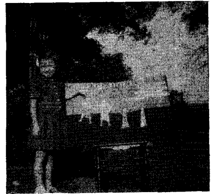
BETTY JOY BOVARD, of the New Hope junior class, uses the flannelgraph to demonstrate to the rest of the group the story she is learning.

memory verse for the day, one of an alphabet I have prepared. These verses have been distributed on mimeographed slips the week before. The hostess takes the roll and gives credit for the verses recited correctly with the references. On small colored construction-paper kites, with bright yarn tails, the committed verses are fastened with scotch tape. The boys and girls love to hold these kites for a short time each week and see the verse-tails grow. Hymns and Scriptural choruses are sung, and sometimes seasonal songs are taught. The Bible story is always illustrated with the flannel-graph board or other visual aids. Large Sunday school picture rolls are sometimes used. The course began last year with Genesis and is now covering the period of Joshua-Judges-Ruth. We have secured excellent visual material from the Scripture Press, 800 North Clark Street, Chicago. Some of the children come just to see the pictures. Frequently there is an impromptu dramatization of the story. This is followed by sentence prayers in which the children like to take part. I have been surprised to hear them pray for matters that have been mentioned