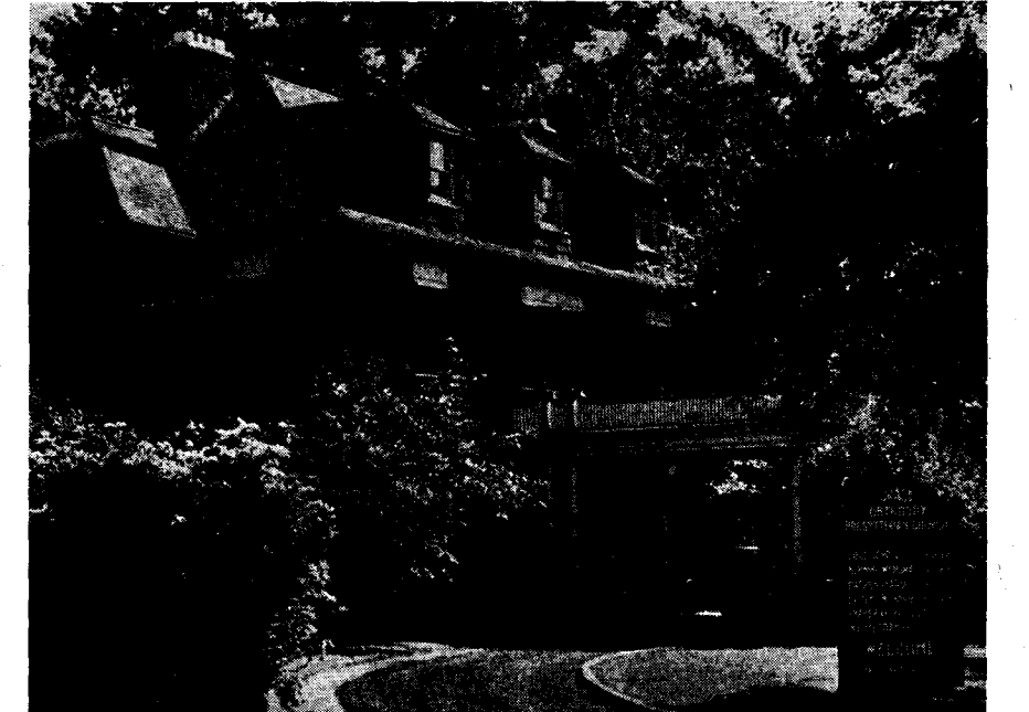
New Property of Grace Orthodox Presbyterian Church, Westfield, N. J.