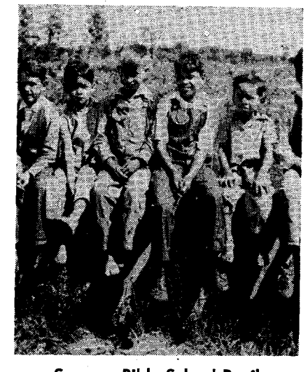
Summer Bible School Pupils

It was a part of these people which formed the nucleus for the Old Stockbridge Orthodox Presbyterian Church in 1936, at which time we were called in to minister to them. Others chose to stay in the John Sargent Memorial Church and in the "white" church in the village of Gresham. However, some who have not chosen to sever connections with the old ties—and