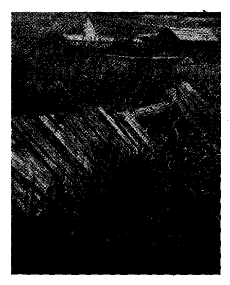
A Pagan Grave Yard

The Presbyterian Guardian is published semi-monthly from September to July, inclusive, and monthly in August by The Presbyterian Guardian Publishing Corperatien, 728 Schaff Building, 1505 Race Street, Philadelphia, Pa., at the following rates, payable in advance, for either old or new subscribers in any part of the world, postage prepaid: $2.00 per year; $1.00 for five months; five or more copies either to separate addresses or in a package to one address, $1.25 each per year; introductory rate for new subscribers only, three months for 25c; 10c per single copy, Entered as second class matter March 4, 1937, at the Post Office at Philadelphia, Pa., under the Act of March 3, 1879.