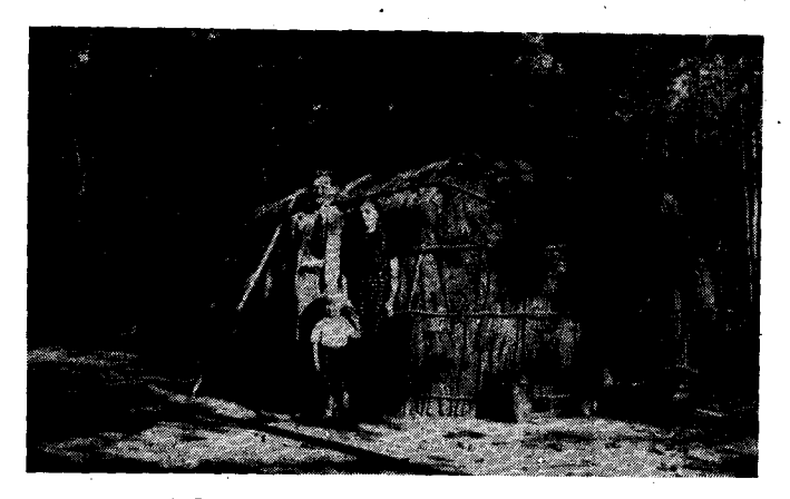
A Pottowattomi Wigwam in the Forest