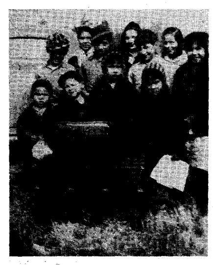
Menominee Indian School Children

We do not believe that "finis" shall be written over the history of the Presbyterian work among the Mohi-(Continued on Page 318)