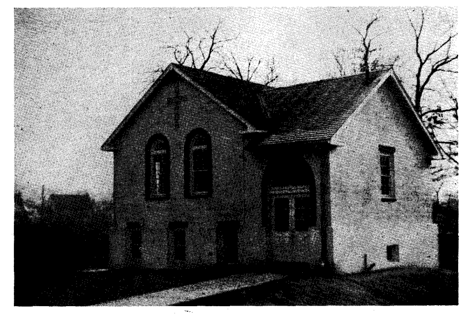
Crescent Park Chapel

Months of delay followed. This delay was caused partly by the reluctance of the bonding company to make any sort of settlement until they were certain that the contractor could not be forced to complete the building, and partly by the difficulty we had of locating another contractor who would be willing to give us a bid on completing the building. Finally, however, a contractor who would finish the building was located. It turned out that the amount of money which he wanted for the completion of the building, which was now about half finished, would result in a loss to us of about $5,500. This amount was given to us by the bonding company. I think one lesson which all of us connected with this situation learned was that if there is any doubt whatsoever concerning the trust-