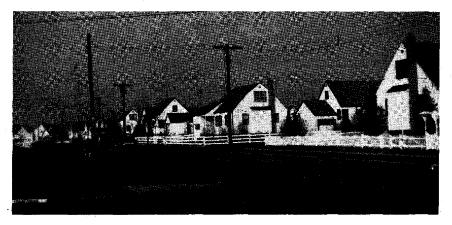
View of Community taken from Crescent Park Chapel

This Fellowship appears designed to take over some of the work of the Continuation Committee which officially ceased its activities last spring.