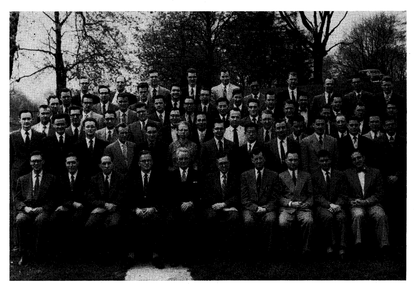
Westminster Theological Seminary - Faculty and Students, Spring 1955