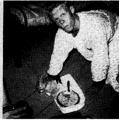
May 25, 1959