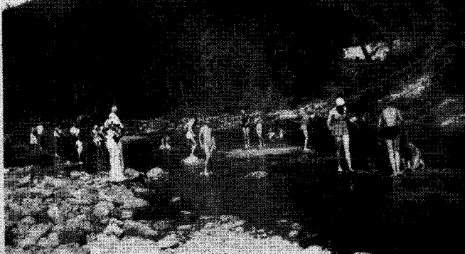
Time for Class