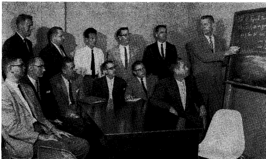
PSYCHIATRIC WORKSHOP FOR PASTORS AT PINE REST