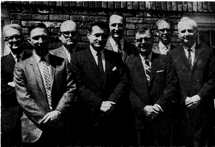
THE SESSION OF GRACE CHURCH, WESTFIELD, NEW JERSEY