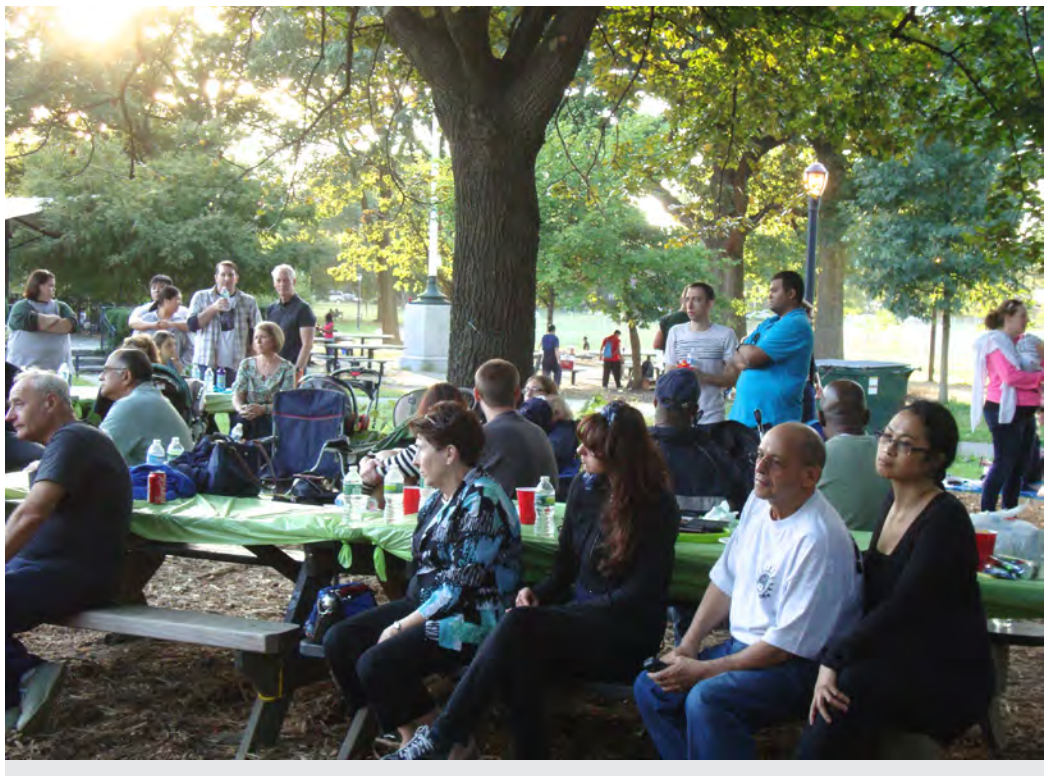
Queens BBQ&A 2012

Turning church inside out means constantly thinking about how to make the whole event go smoothly—and yet still be a church-wide effort. In this case, there would be grill men and grill women, volunteers to play with the children, photographers and videographers, a setup crew, a cleanup crew, and volunteers who would bring soda, chips, dips, and dessert. Everyone would receive invitation cards, and everyone would be encouraged to invite as many others as possible. In addition, everyone was asked to begin thinking of the questions they would ask during the Q&A