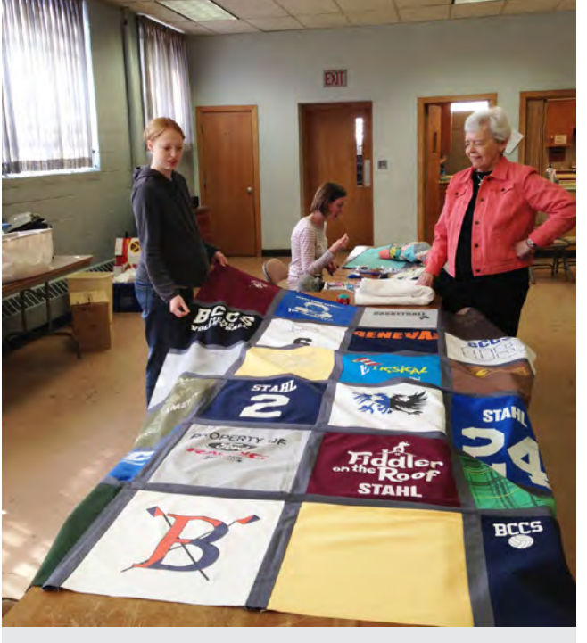
Finishing a T-shirt quilt

The author is general secretary of the Committee on Home Missions and Church Extension.