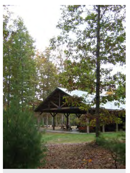
MRCC picnic facility

Science Camp, July 14–19 Labor Day Retreat, Aug. 29–Sept. 1