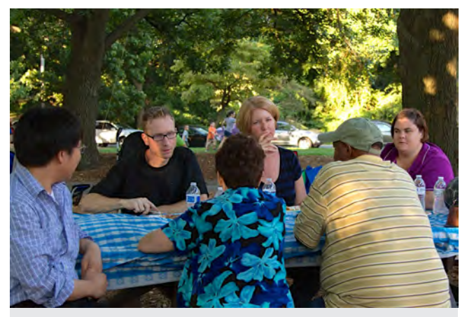
Discussion at Queens BBQ&A 2013

The author is an evangelist serving as the organizing pastor of Reformation Presbyterian Church in New York City, N.Y.