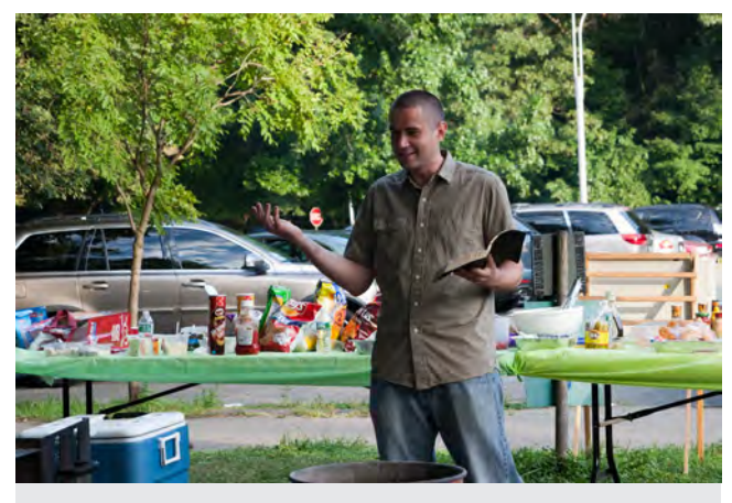
Preaching at Queens BBQ&A 2012

time. From start to finish, this was making use of the gifts that God had placed inside Reformation: the people, the funds, the abilities and creativity of the