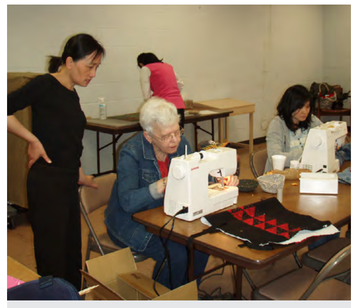
Instruction in the use of sewing machines