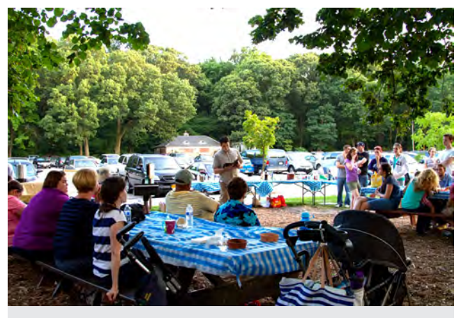
People hearing the good news at Queens BBQ&A 2013

The Meetup site for BBQ&A (meetup.com/BBQ-A-2013-at-Cunningham-Park) serves as a place where Reformation photographers