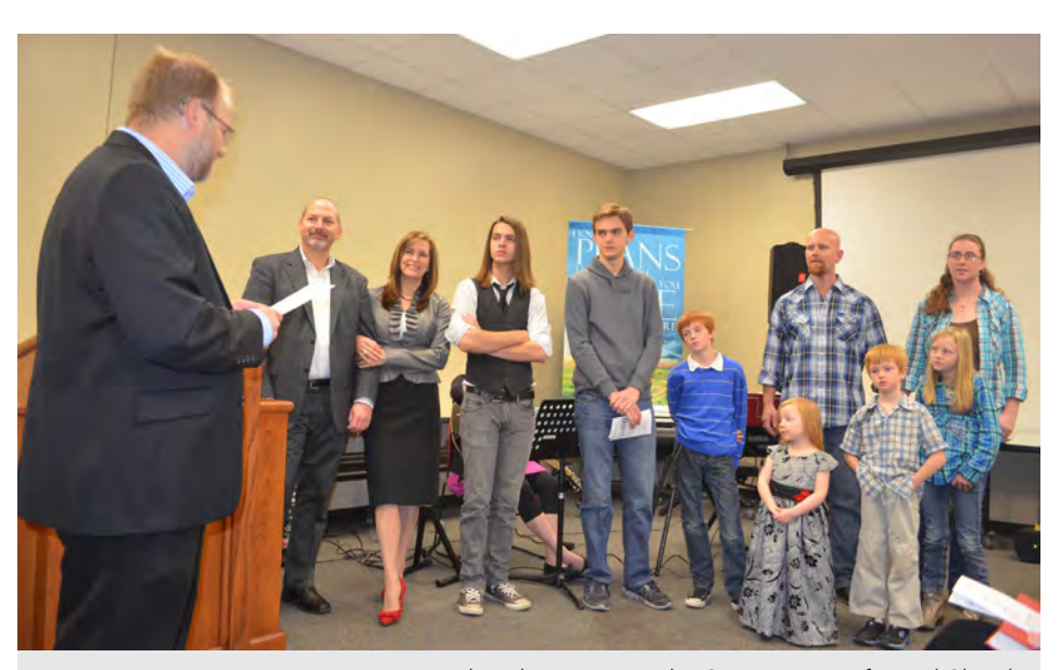
New members being received at San Antonio Reformed Church

Despite the difficulties involved, and the great possibility of failure on my part as a suburban farmer, I have found this to be a most rewarding and worthy exercise. I have taken great joy in seeing new life emerge from below the soil, being able to