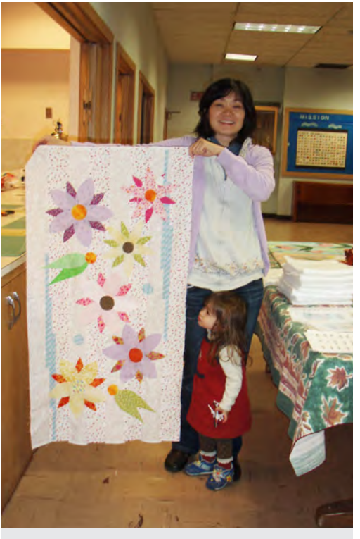
Another project completed!

long to see more and more people gathering for worship. That desire to see