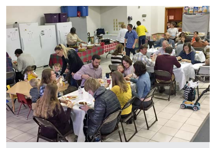
Resurrection OPC enjoying a fellowship dinner

The love of the saints in Houston was every bit as heartwarming as the love they had known back in Oshkosh, and